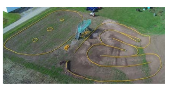
Academy of Model Aeronautics Charter Club # 1490